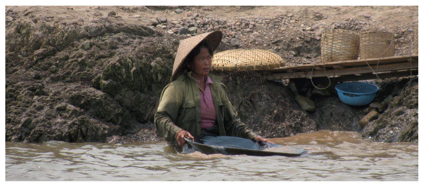
Gold panning in the dry season – important income for many villages along the Mekong, Luang Prabang, Laos, March 2013

political decisions and guidelines are crucial to the livelihoods of current and future generations. These decisions will guide the region towards its destiny. As a result, decisions on the river's usage, development, policies and partnerships need to be as collective as possible and made with the best possible knowledge, principles, values and conscience.