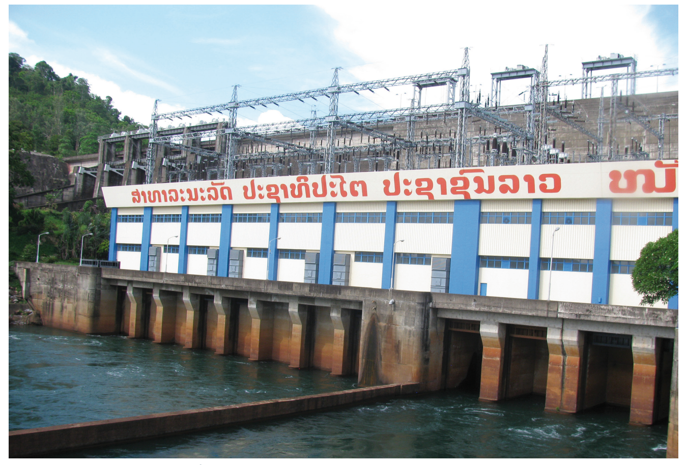
Nam Ngum 1 hydropower dam - the first dam built in Laos

adverse effects on wild-capture fishery productivity. Further, as highlighted by experts, this will drastically affect the fisheries which provide employment and are also the main source of protein. Lastly, damming would impact on sediment patterns in the Mekong and, according to Blake, half the Mekong's annual sediment load which originates in the Chinese part of the river basin