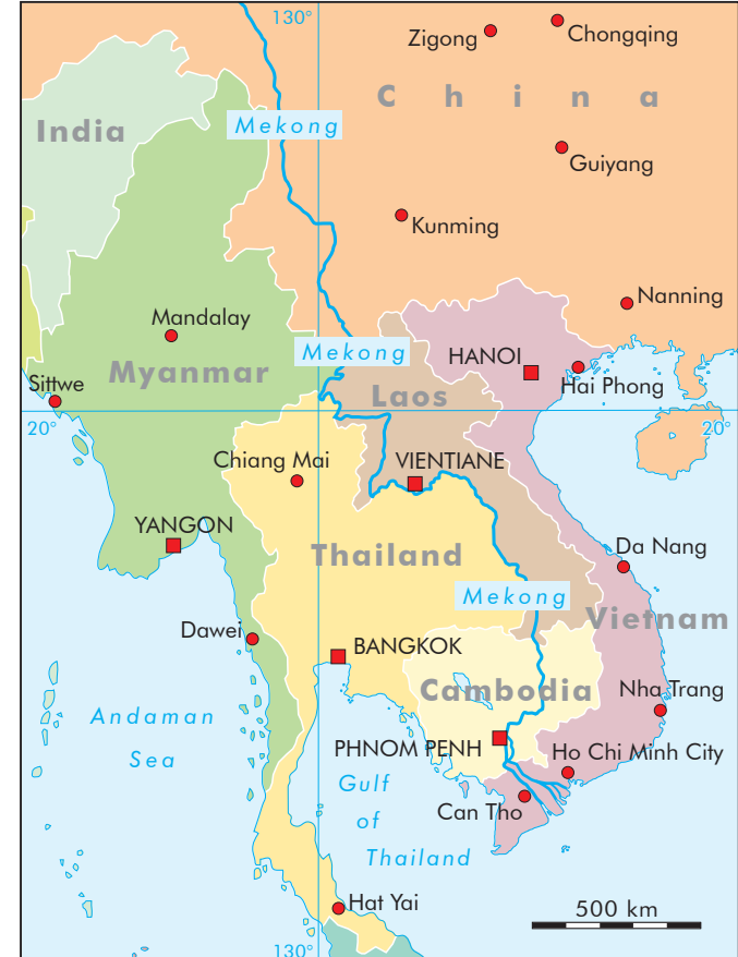
Map 1: Mekong Greater Subregion

The Mekong River is the largest river in Southeast Asia and the eight largest in the world (Campbell, 2009). It has enormous economic and ecological resources as well as political significance (Goh, 2006; Osborne, 2006). The Mekong River is central for food, accommodation and employment to millions and is also vital for the development of the entire Mekong region. However, these developments are currently at a crossroad which could lead towards peace, cooperation and harmony or conflict, dispute and insecurity. Floods, droughts, famines, environmental disas-