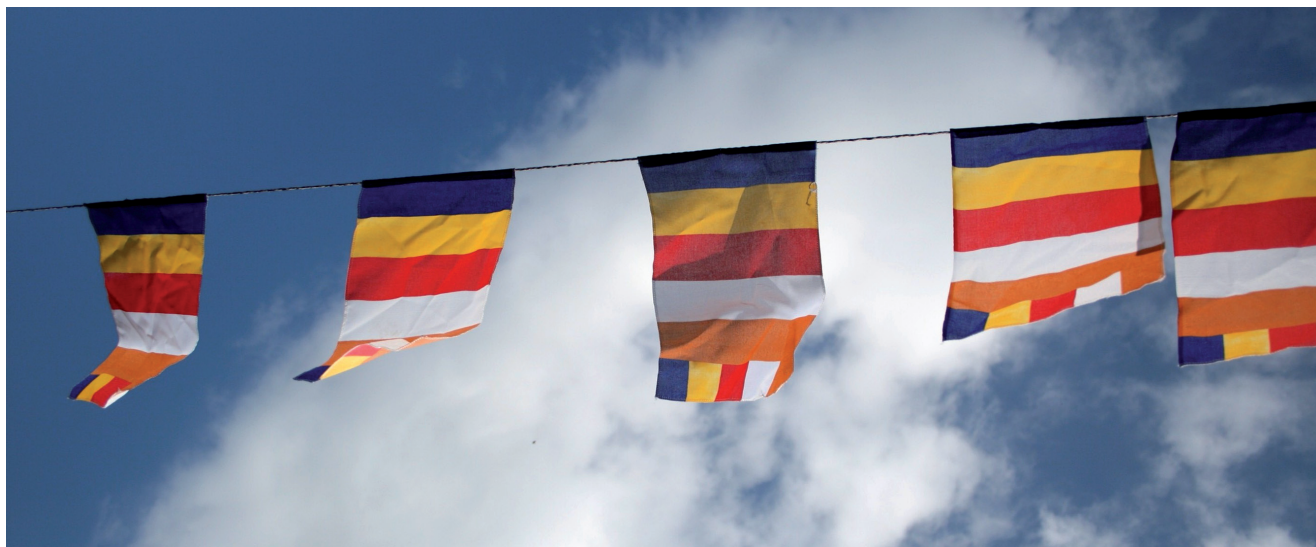
From Chanting to Chán: About the Generational Gap among Vietnamese Buddhists in Switzerland – 20