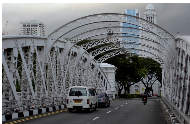
How to Reach Green Governance in Asia-Pacific? – 29