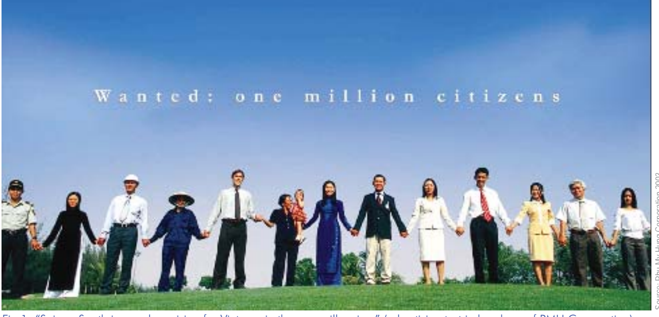
Fig 1: "Saigon South is an urban vision for Vietnam in the new millennium" (advertising text in brochure of PMH Corporation)