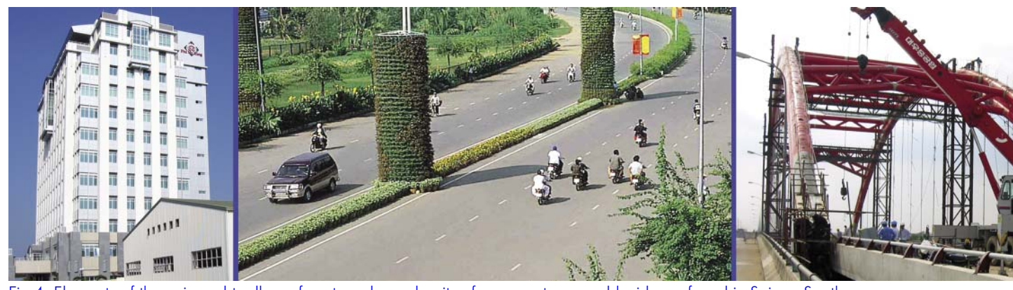
Fig 4: Elements of the universal toolbox of post-modern urbanity of any new town world-wide, as found in Saigon South

in 1997. The Saigon South City as well as - among others - the only foreign-invested housing project currently licensed in Hanoi, the $2.1 billion Ciputra Hanoi International City Project (managed by an Indonesian-Vietnamese joint venture company) are thus visual proof of Vietnam's ambition to increase its integration into a economically and culturally globalizing world. The visible outcome is an internationally standardised, consumer-oriented architecture (GOTSCH & PETEREK 2003: 1). Strangely, there seems to be no current empirical data on the target groups' aspirations and preferences towards this kind of uniform architecture and the coherent new urban area concepts.