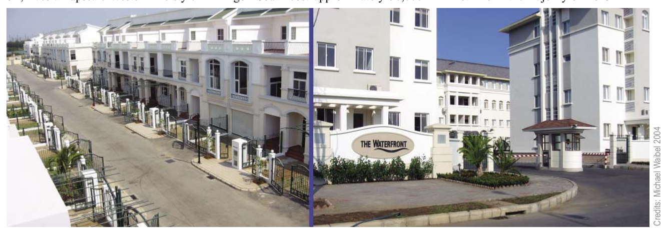
Fig 5: Appartments of middle classes' dreams

However, the property boom is increasingly preventing access to the housing markets for low-income groups, who still form the majority of Ho Chi Minh