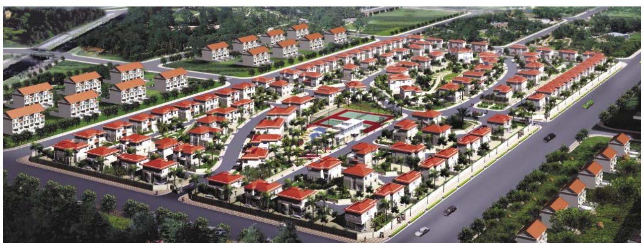
Fig 3: Plan of a residential quarter within the New City Center of Saigon South

Conceptually, the new Saigon South urban area is also very similar to those erected in the 1990s, e.g., in the metropolitan regions of Greater Seoul, Jakarta, Kuala Lumpur or Bangkok, and represents modern as well as internationally standardized town planning (NGUYEN 2003: 15). The Phu My Hung Corporation proudly advertises the fact that the Saigon South Master Plan, drawn up by the world-renowned Skidmore, Owings & Merrill (SOM) Planning Bureau, has won several awards including the Progressive Architecture Citation in 1995 and the American Institute of Architects (AIA) Honor Award for Urban Design